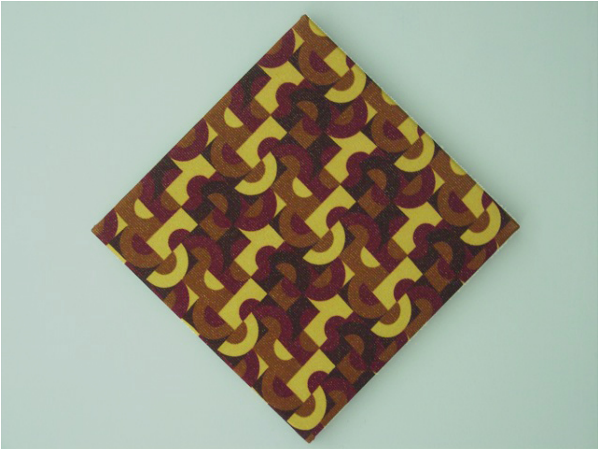
Bas vd Hurk Untitled 2010 Stretched fabric on stretcher 40 x 40 cm