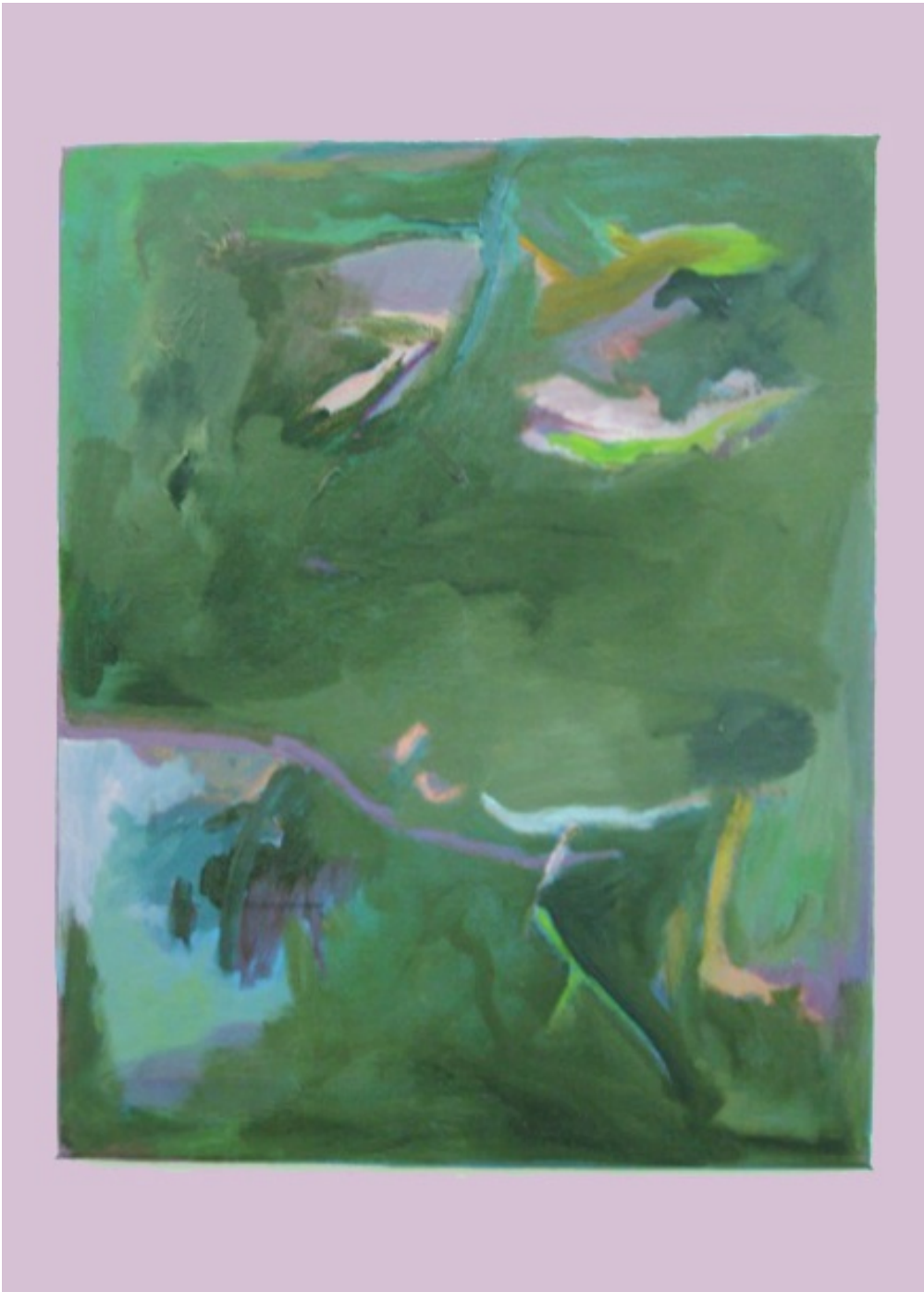
Bas vd Hurk Untitled 2010 Oil on canvas 40 x 30 cm