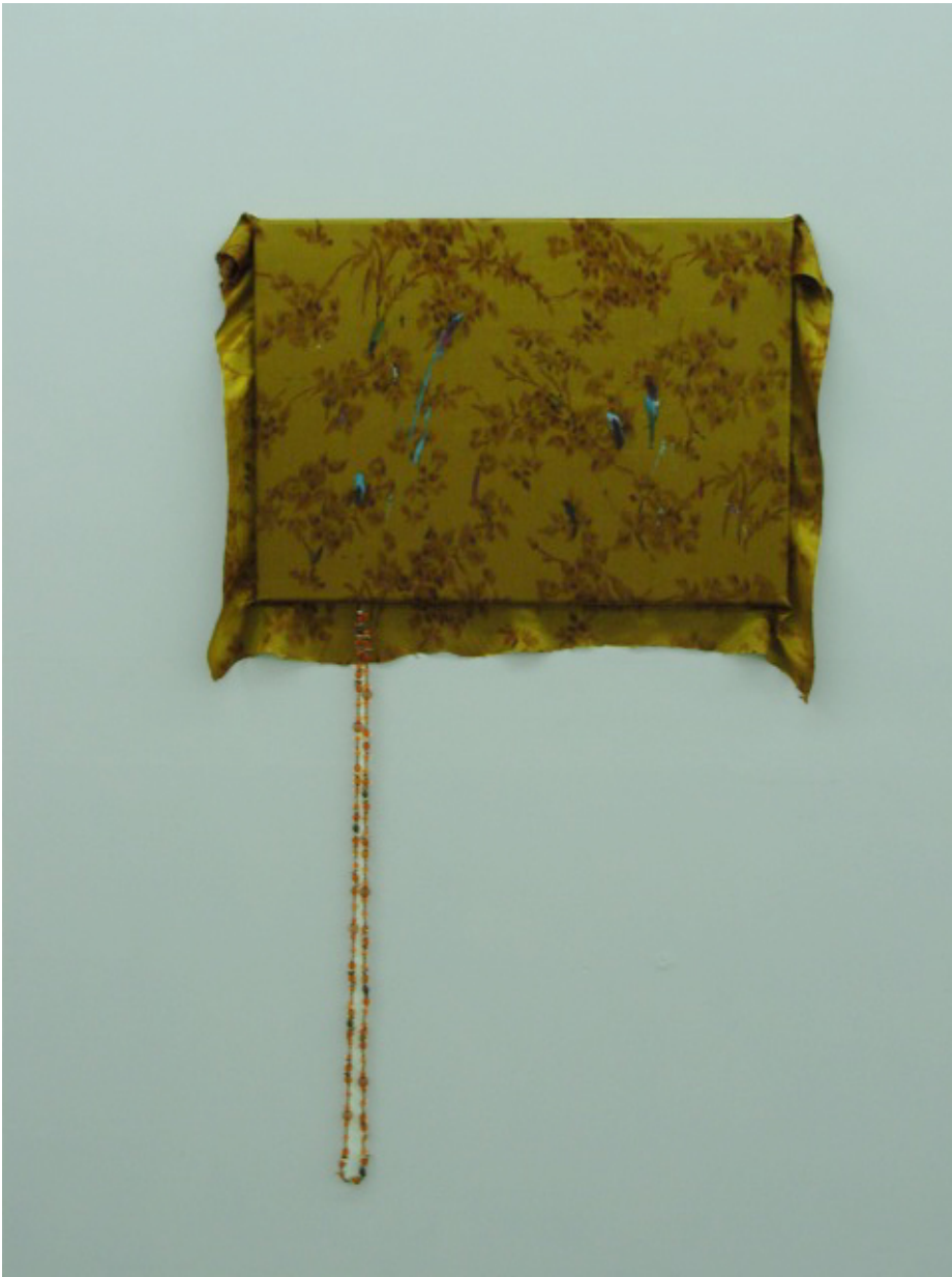
Bas vd Hurk Untitled 2010 Oil and acrylics on fabric on stretcher with pendant 100 x 80 cm