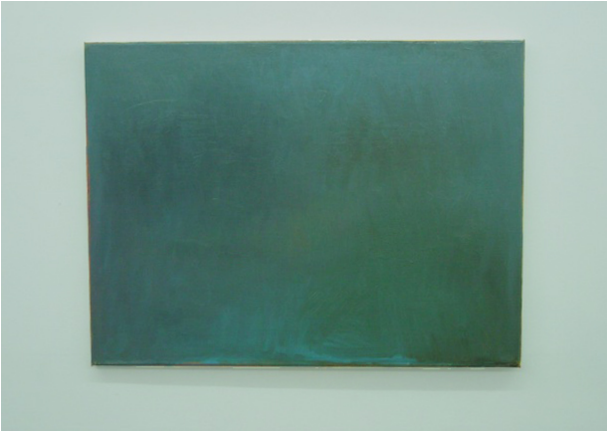
Bas vd Hurk Untitled 2010 Oil on canvas 100 x 80 cm